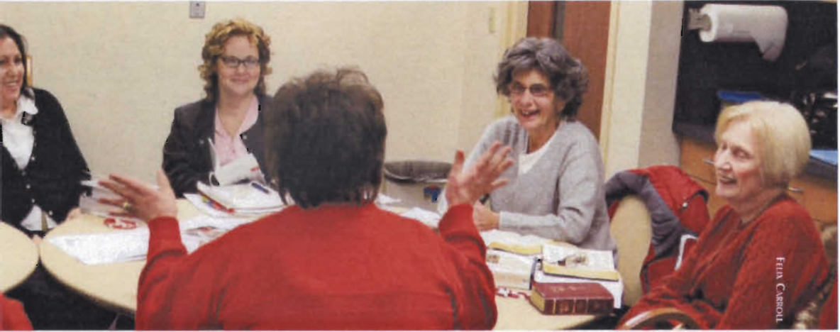
these women say they are called to be ambassadors of Christ and witnesses of His great mercy.

is not quite right. They know this town. They know who's lonely, who's unemployed, and who's in need of a hot meal. They know who's enduring crises of faith, marital problems, or health issues.