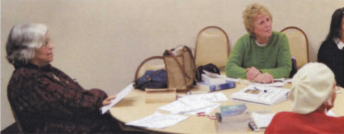
Queen of Heaven Parish's cenacle members meet in Uniontown, Ohio. Like cenacle members throughout the world,